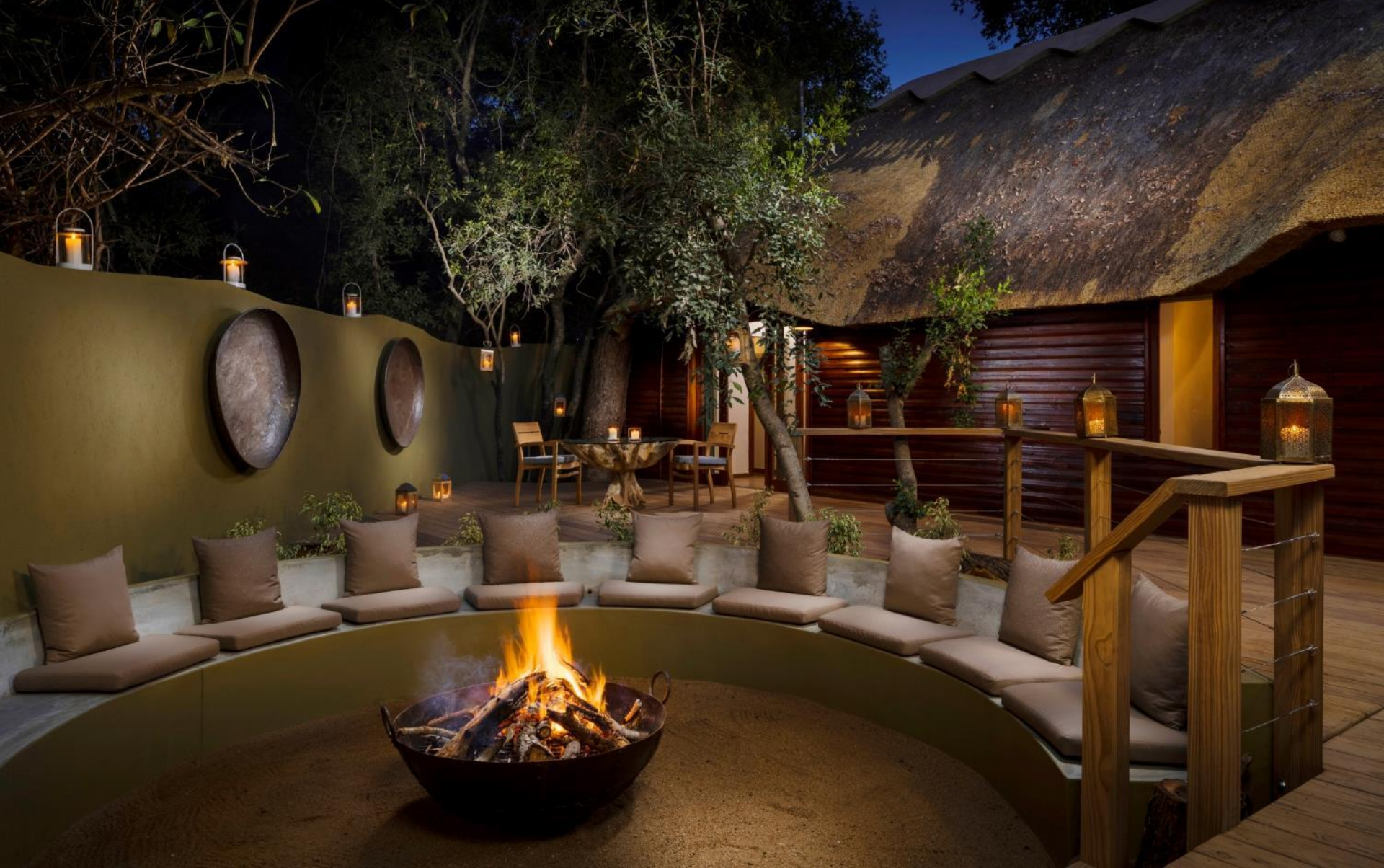
Safari Suite Fire pit – private entrance