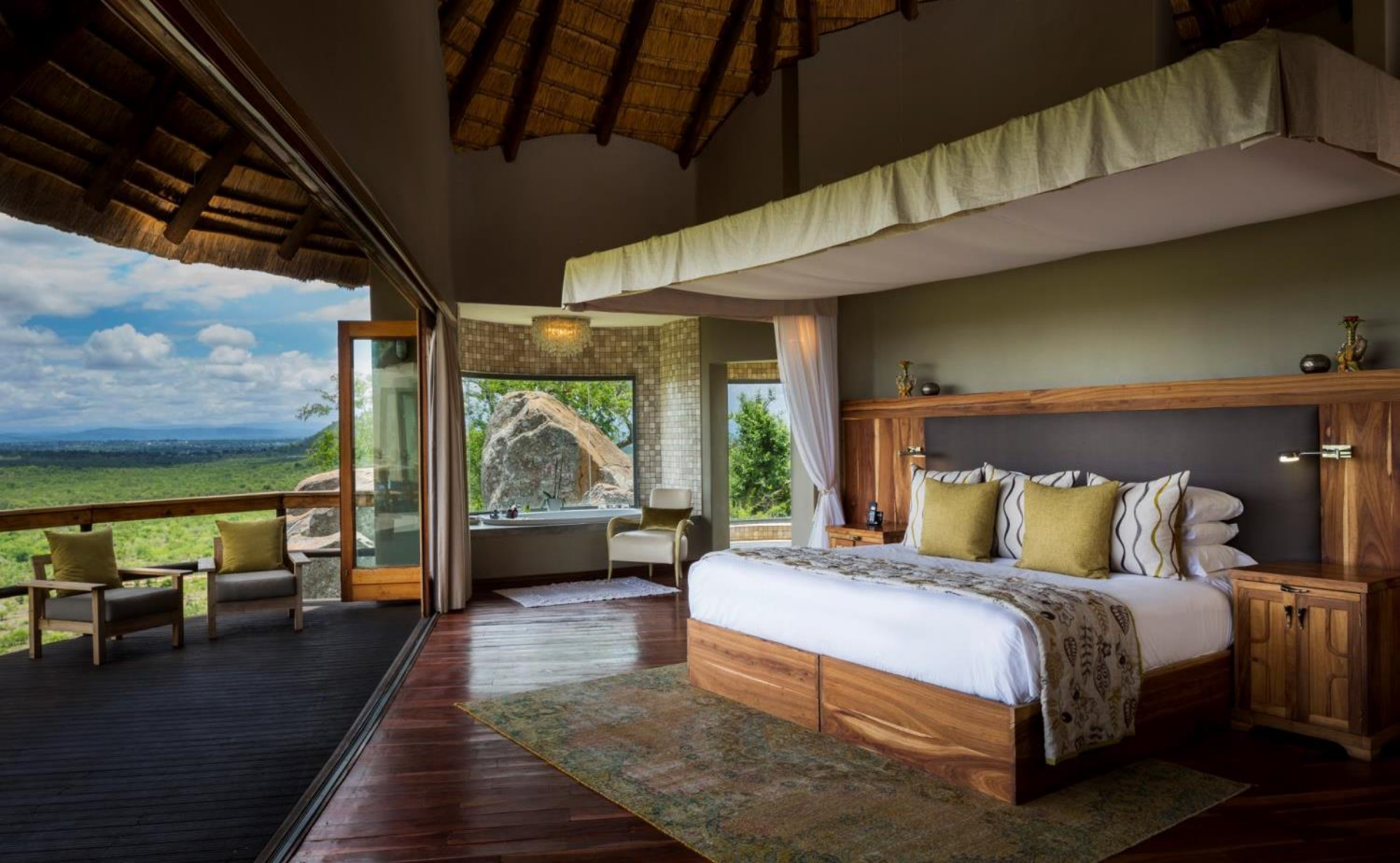
Cliff Lodge Suite 1, with swimming pool