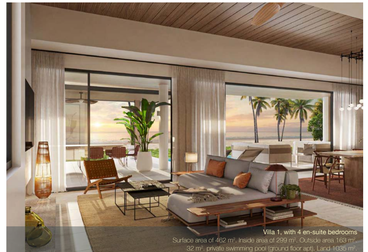
Villa 1, with 4 en-suite bedrooms Surface area of 462 m 2 . Inside area of 299 m 2 . Outside area 163 m 2 . 32 m 2 . private swimming pool (ground floor apt). Land 1035 m 2 .