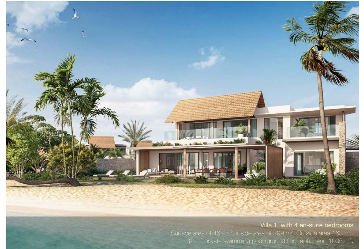
Villa 1, with 4 en-suite bedrooms Surface area of 462 m 2 . Inside area of 299 m 2 . Outside area 163 m 2 . 32 m 2 private swimming pool (ground floor apt). Land 1035 m 2 .

For those in the continuous search for perfection in details, we have also created Villa 1 – a real estate myth which introduces you to the exceptional, and unique, 4 bedrooms en-suite. Stunningly designed, it personifies elegance with the best of contemporary architectural design. Facing the lagoon and Le Morne and in direct contact with the beach, Villa 1 is a rare real estate opportunity in Mauritius.